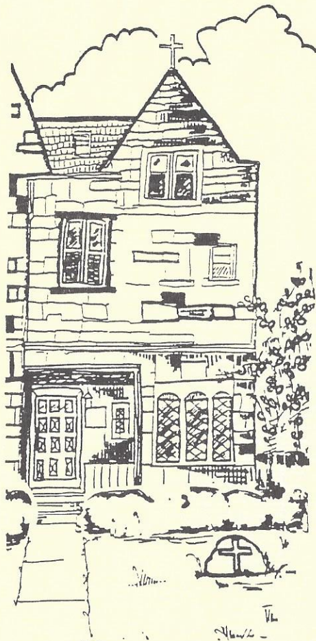
Chancery Diocese of Columbus